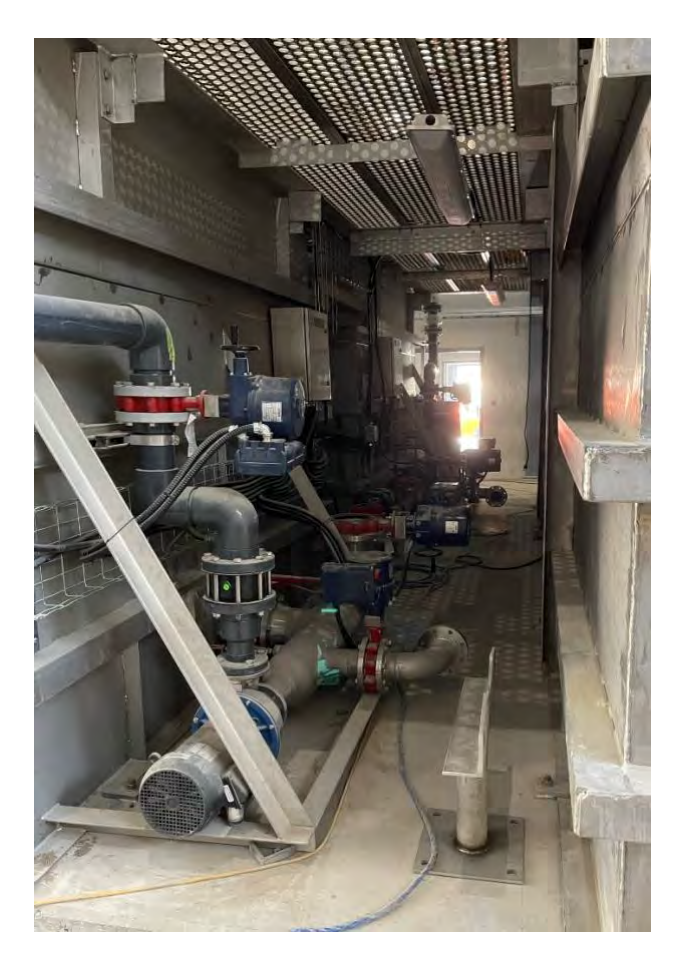
Water Filtration Plant Construction Progress