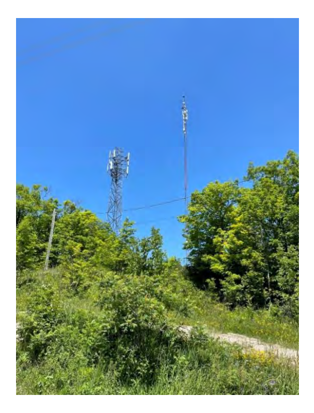
Microwave radio-based tower serving Nawash

The lack of stable and reliable Internet not only impacts education, health care, and economic growth, but it also affects the community's ability to have clean drinking water.