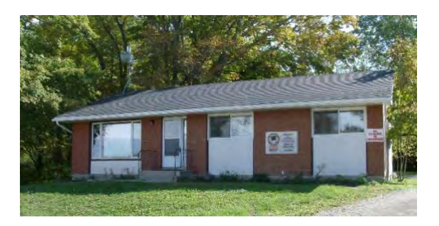
Board of Education Office

Healthcare is one piece of a larger puzzle, all impacted by access to the Internet. Education is another barrier the community faces.