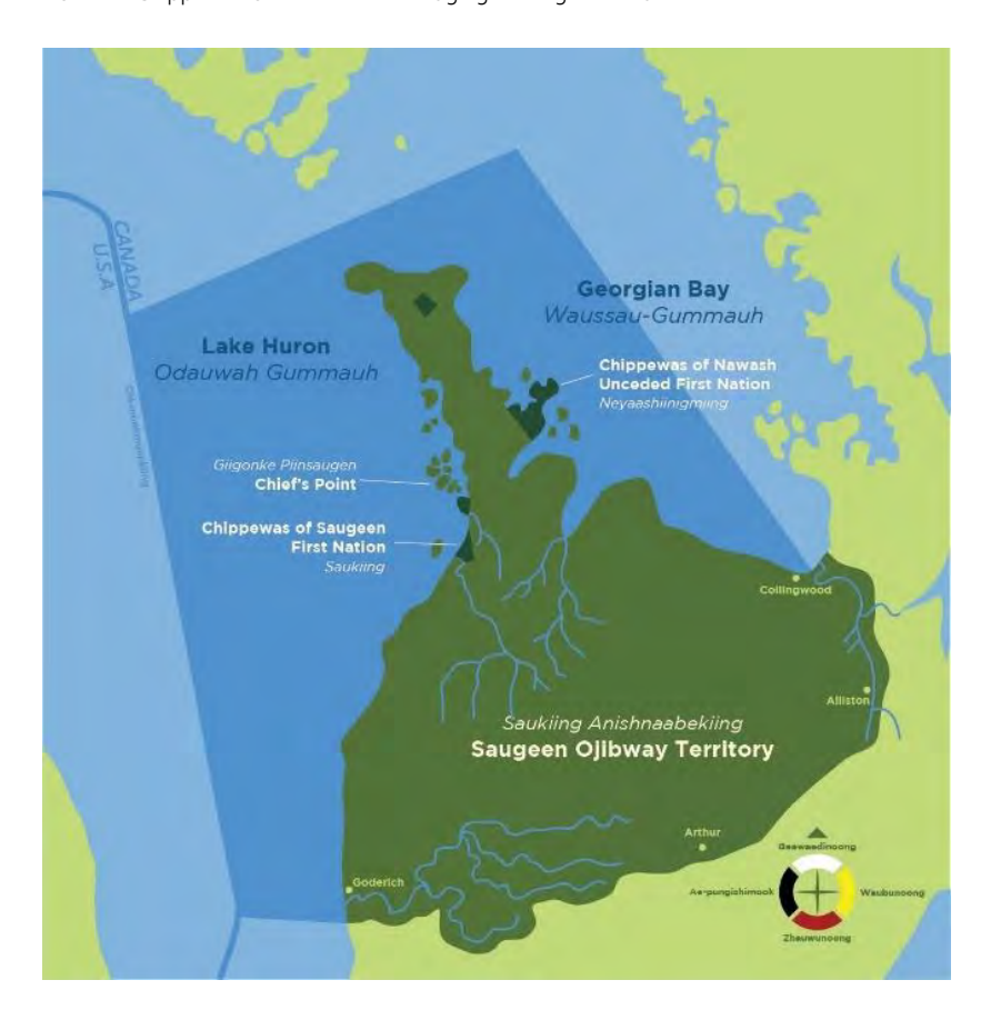
Saugeen Ojibway Nation Territory

In 1968, approximately 90 fishing islands in Lake Huron were returned to the Saugeen Ojibway.