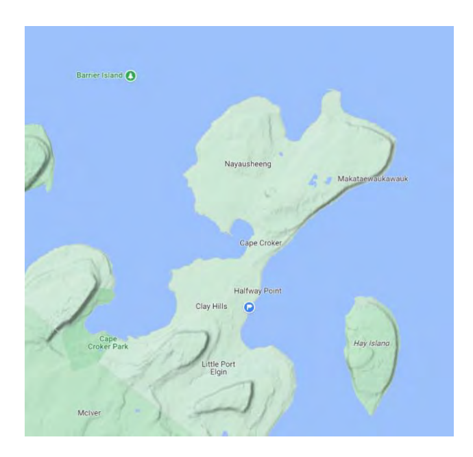
Topographical map of the area

The peninsula-shaped land base offers a shoreline of approximately 48 km along Georgian Bay; however, there is no thoroughfare of traffic to other destinations, which creates barriers of a different kind.