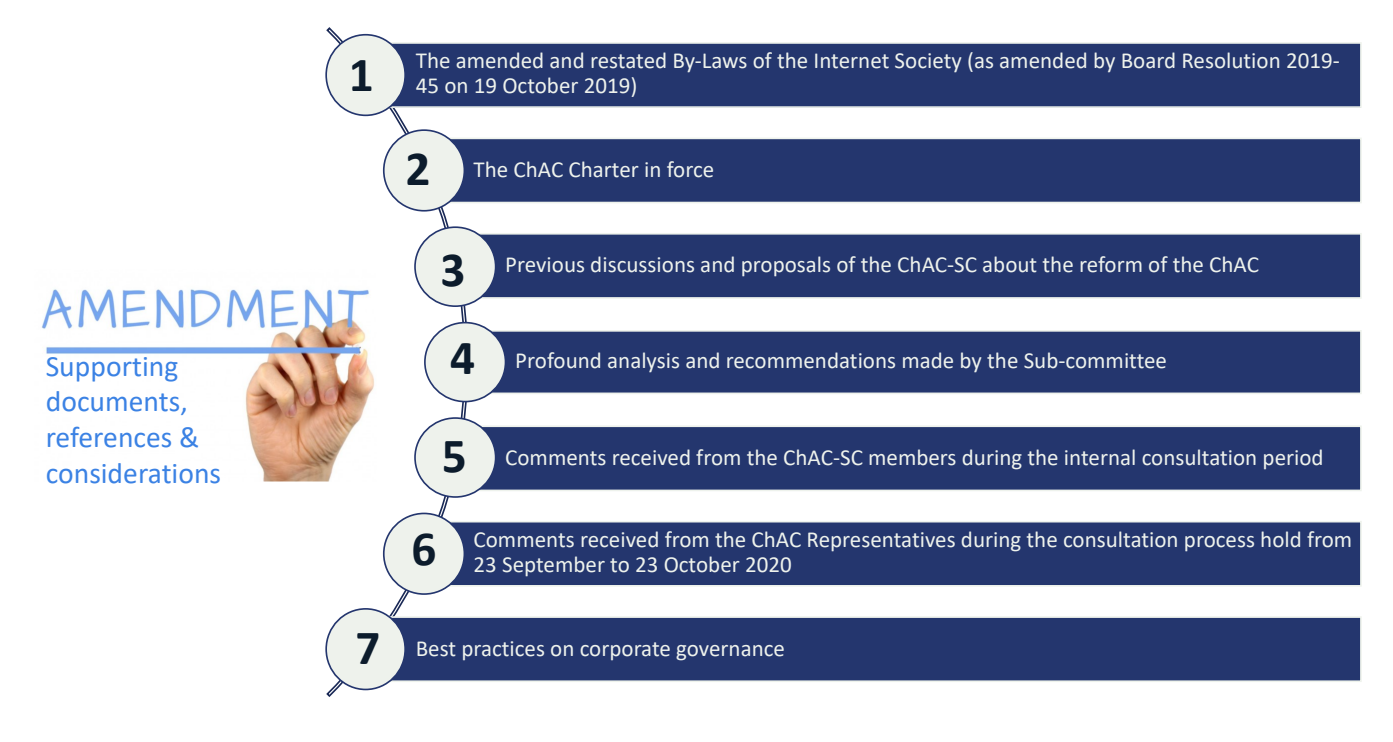
Figure 1. Supporting documents, references and other considerations taken into account for Amending Proposal of the ChAC Charter

This amending proposal for the ChAC Charter takes into consideration the different analysis and recommendations from the Subcommittee.